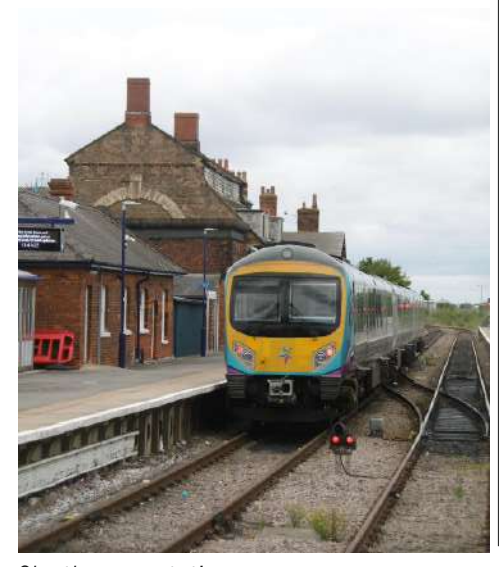
Cleethorpes station

• Since publication of the June Rail Lincs. the Barton Line service was badly impacted between 20-26 June and in the middle of July. Partly due to industrial action and hot weather. On Sunday 17 July unit 156907 failed after working the 11:10 service from Barton and all following services were cancelled until the afternoon of Wednesday. The extended delay was due to lack of suitable replacement units. By September, the Barton service had returned to a high level of reliability thanks to the efforts of East Midlands Railway (EMR). However, some issues were out of their control, such as when Barton units were blocked in by TransPennine Express (TPE) units at Cleethorpes and could not start until TPE drivers became available to release them. The problem is being raised with TPE and also with EMR to see if Barton