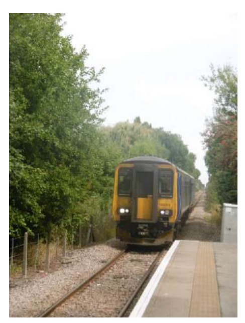
156413 approaching Barton station

Line units could be stabled overnight at Lincoln. For the longer-term Network Rail will be approached to see if platforms 5 & 6 at Cleethorpes could be restored for passenger use to allow for greater flexibility in the stabling of trains.