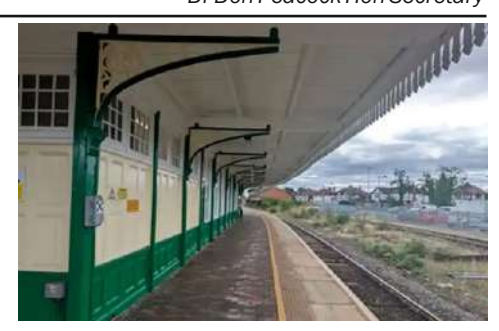
The island platform at Sleaford from platform 1 and view east from the island platform