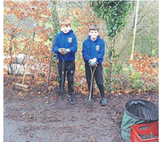
Swimbridge Primary School