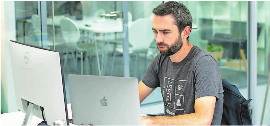
Devon Work Hubs