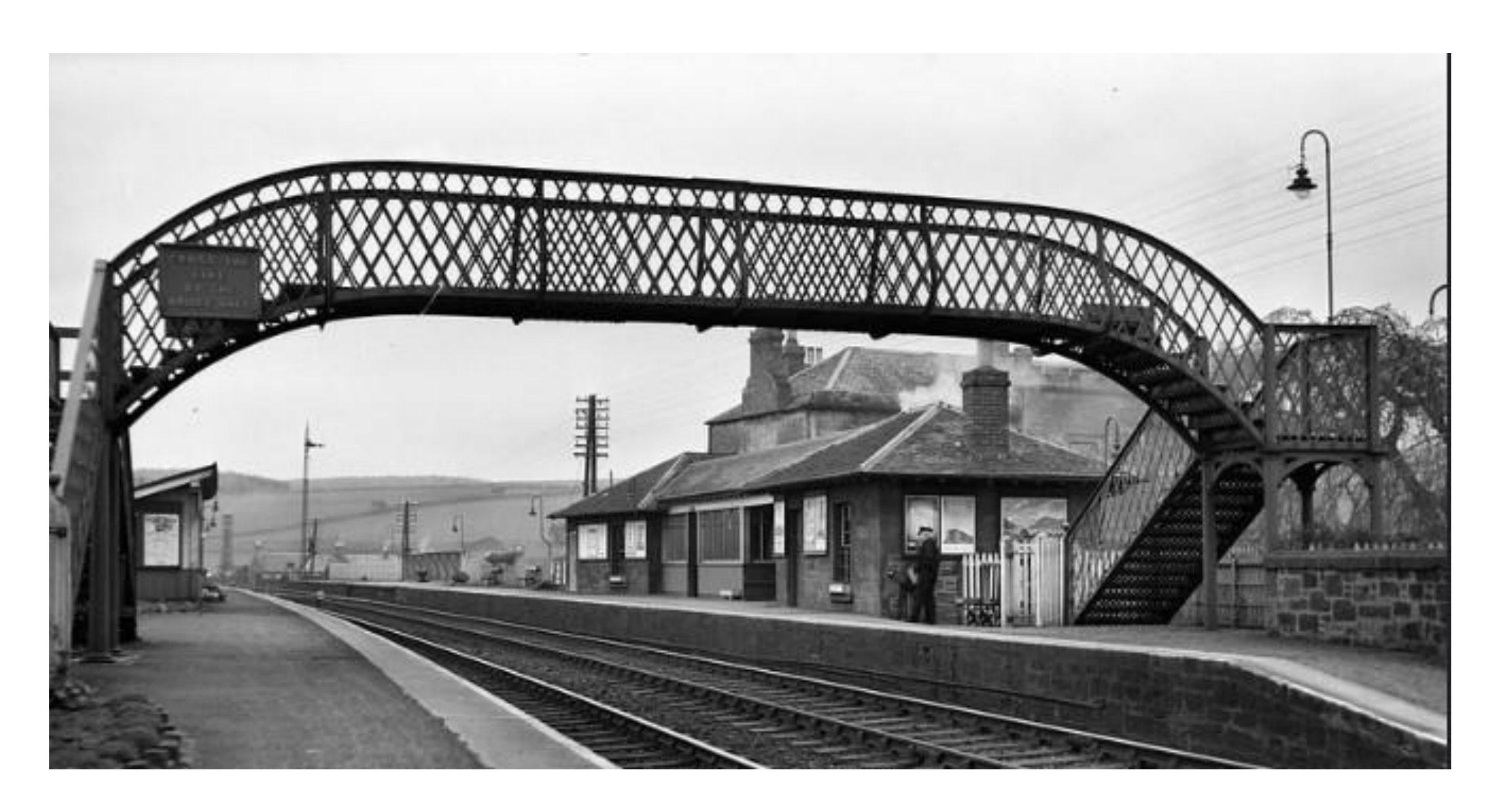
Looking East 24/04/1954