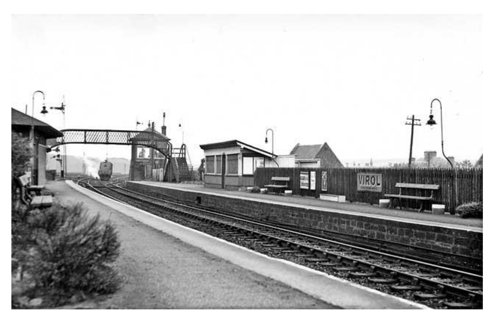
Looking West 24/04/1964