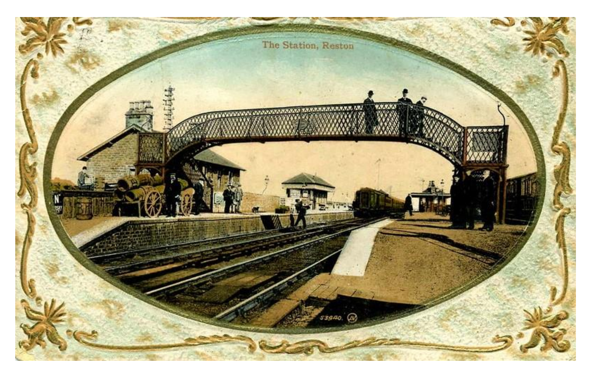
Reston Railway Station Circa 1905