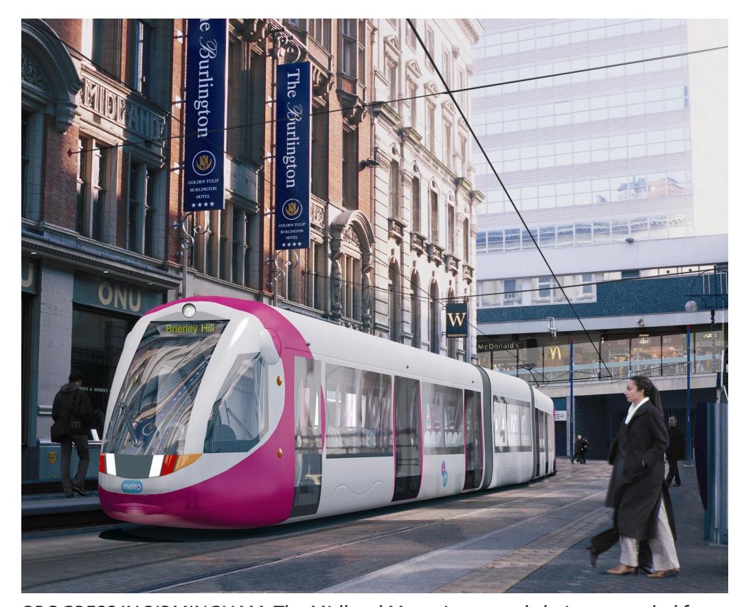
PROGRESS IN BIRMINGHAM: The Midland Metro is currently being extended from Birmingham Snow Hill station through the city centre to serve New Street station. A new fleet of Urbos 3 trams, as in the artist's impression above, is being delivered to the Metro's Wednesbury depot. The Metro is expected to be extended further to serve the High Speed Two terminus at Curzon Street

www.gov.uk/government/news/new-deal-for-rail-in-the-north