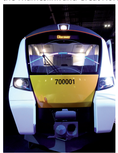
A mock-up of the Thameslink trains to be built by Siemens

The first major competition in the current franchising round was completed on 23 May 2014 with the announcement that the Thameslink, Southern and Great Northern franchise would be operated by Govia Thameslink Railway, a company formed by the Go-Ahead Group and SNCF subsidiary Keolis. The takeover of the combined services, which will be the largest in the country in terms of passenger numbers, will be in two stages with Govia running the Thameslink and Great Northern trains (currently First Capital Connect)