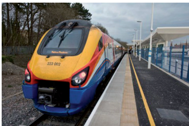
A train at Corby with the destination board Melton Mowbray.

The fifth anniversary of the reopening of Corby station coincided with the opening of a new pedestrian approach route from the town centre. The new steps, which incorporate a ramp for bikes, will take about 300 yards off the route used by residents and students at