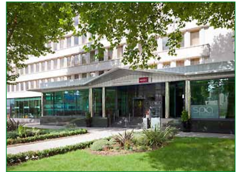
The hotel is 10 minutes walk from Temple Meads station