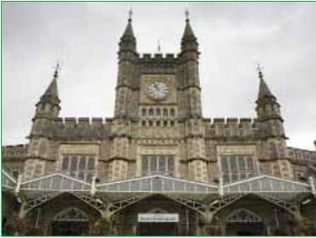
Isambard Kingdom Brunel's Bristol Temple Meads station

Mercure Bristol Holland House Hotel and Spa, Redcliff Hill, Bristol BS1 6SQ