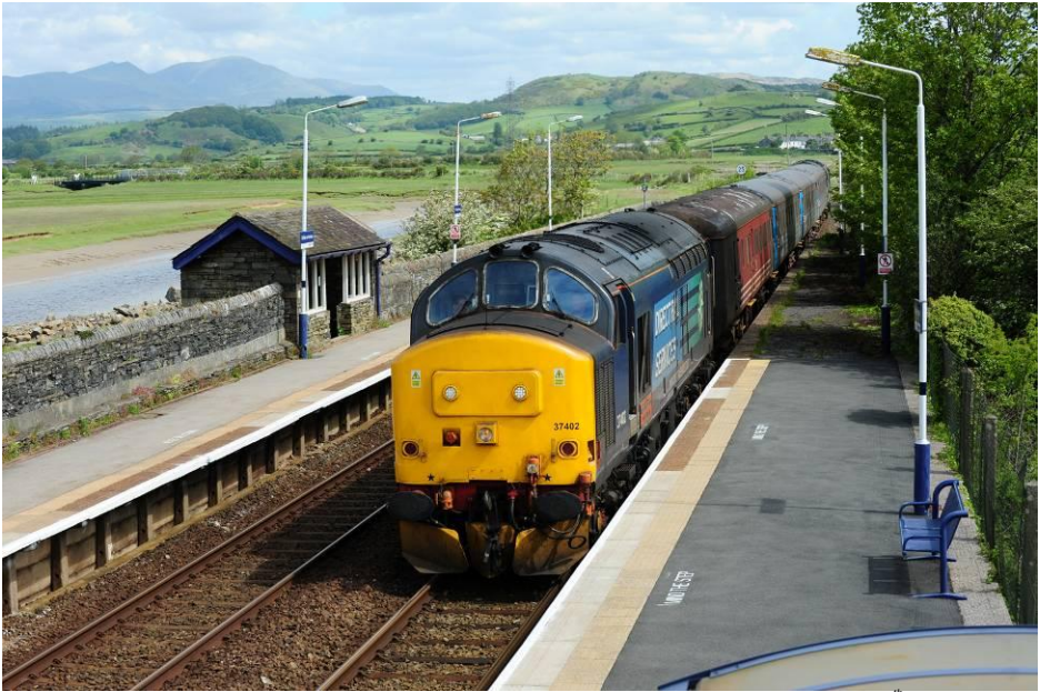
Locomotive hauled trains arrive on the Cumbrian Coast and Furness Line, seen here at Kirkby-in-Furness on 4 th June. DRS loco 37402 "Stephen Middlemore" on the 0842 Carlisle - Barrow Northern Rail service.