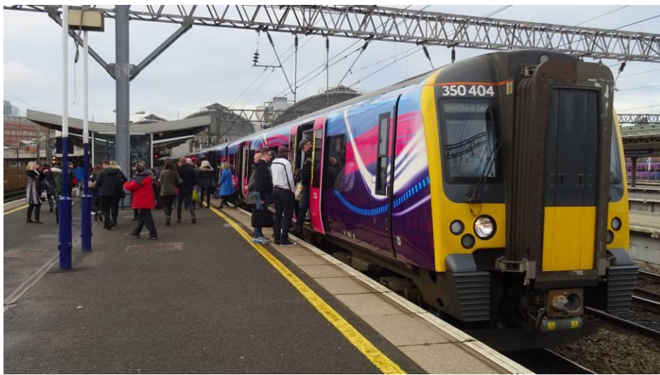
TPE Siemens Desiro Class 350 at Manchester Piccadilly Stations on a busy December Sunday.