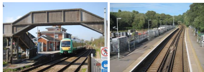
How many 3-letter stations besides Rye (l) and Ore (r)?

As reported before, other local aspirations Railfuture supports are a later last return service between Hastings and Ashford, probably by returning the 21.21 arrival in Brighton as a 21.30 departure to Ashford and then from there back to Hastings at 23.33, and an all-day/every-day service at Ore on the back of the time-saving achieved through the promised line-speed improvement between Ore and Doleham by 2019.