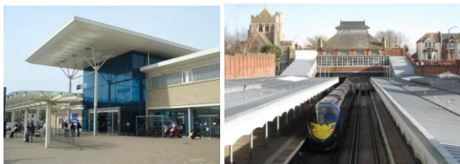
E. Sussex coast HS1 towns Hastings (l) and Bexhill (r)

It's now almost three years since an AGM of the Rye-based, Railfuture-affiliated MarshLink Action Group (MLAG) https://marshlinkaction.wordpress.com first heard from Network Rail, in the context of major and extended disruption to the Hastings-St. Leonards-Tonbridge route due to several landslips, of their new approach to improving the resilience and performance of rail access to and from that part of East Sussex. In short, the best option seen then and since is to enable services to/from London St. Pancras International and Stratford International to reach Bexhill, St. Leonards, Hastings and Rye via Ashford International.