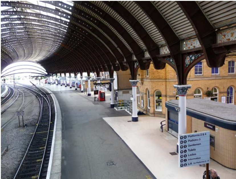
York Station, showing the open views from the footbridge