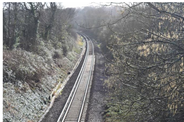
The single track Fareham to Botley railway line looking South from the footbridge just North of Welborne