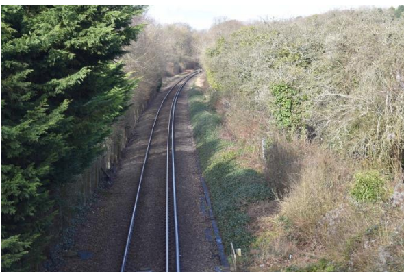
The single track Fareham to Botley railway line looking North from Funtley Road bridge just South of Welborne

By switching many journeys from car to train the station would take many cars off the road and prevent road traffic congestion.