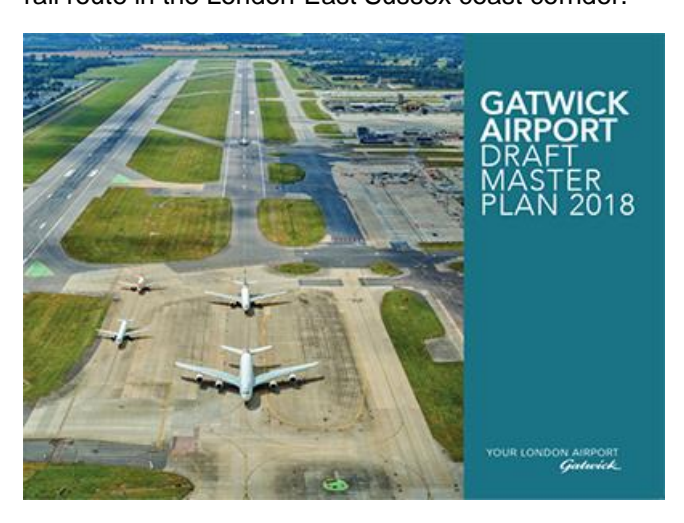
Read coverage in previous issues of newsletter railse <a href="https://www.railfuture.org.uk/London+and+South+East+branch+news">https://www.railfuture.org.uk/London+and+South+East+branch+news</a>

Like or not, another place which will not stop growing is Gatwick Airport . It has its own targets for improving sustainable surface access, and its pressures on and demands of area transport networks will need another rail route in the London-East Sussex coast corridor.