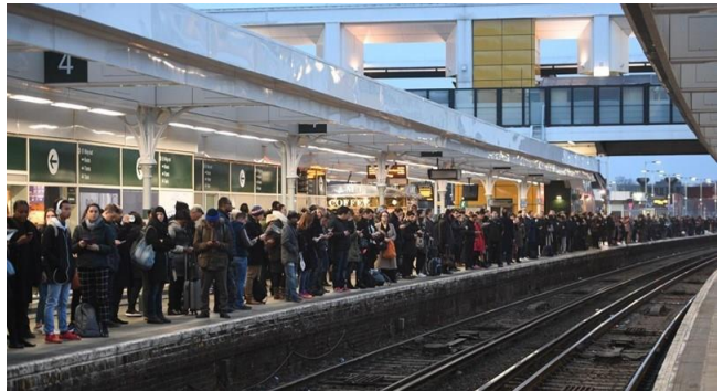
East Croydon station, platform 4, on 'up slow' line to London

If good things come to those who wait then in 12 years' time, subject to the essential 'health warnings' about gaining legal powers and funding, we can look forward to the 'bigger better railway' we campaign for arriving at East Croydon, and also Norwood Junction, stations.