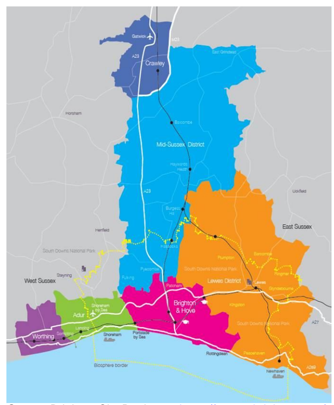
Greater Brighton City Region: <a href="https://greaterbrighton.com/">https://greaterbrighton.com/</a>

According to the NIA referred to on p.2, Brighton is one of the UK's top 25 cities, by employment, and one of 10 (Solent and Bournemouth being the other two south of London) with a high-growth/high-congestion dilemma to solve. Only Milton Keynes and Coventry appear to enjoy the relative luxury of high growth/low congestion.