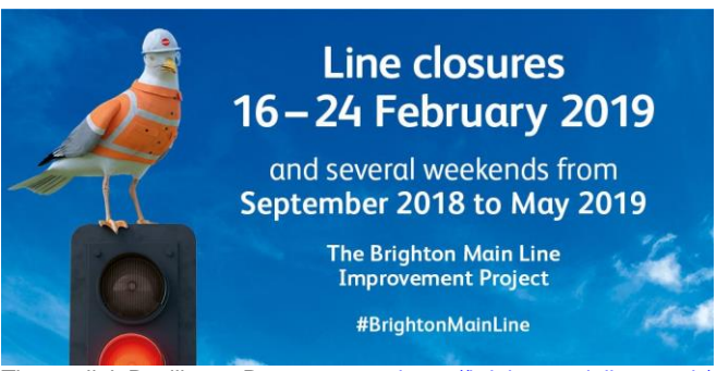
Thameslink Resilience Programme: <a href="https://brightonmainline.co.uk">https://brightonmainline.co.uk</a>

The Strategy has eight priorities, one of which is to "Promote better transport and mobility" thus: "We will lead lobbying for investment in a state-of-the-art digital railway through investment in the Brighton main line and Crossrail 2. We will actively support the creation of Transport for the South East to bring further funds to roads and railways across our area."