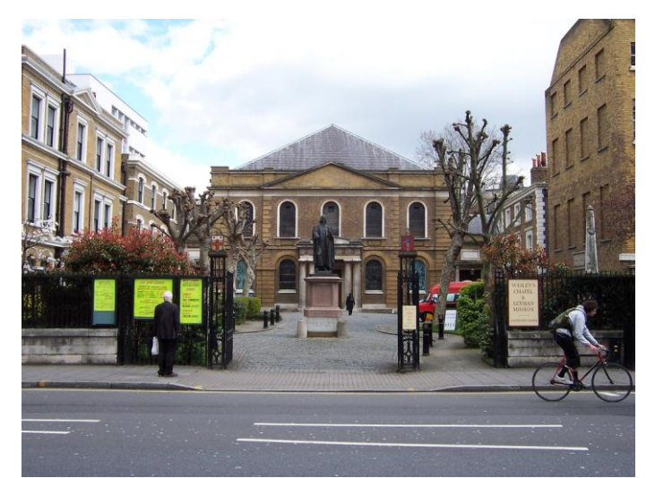
Branch annual meeting venue: Wesley's Chapel, EC1Y 1AU

Before the next edition of inter-railse in May we shall be wending our way to Worthing on Thursday 4<sup>th</sup> to work out, provoked by three speakers and with your support, "How to improve West Coastway rail services" , and then gather in London on Saturday 27<sup>th</sup> for our annual open meeting, with speakers on rail access to airports.