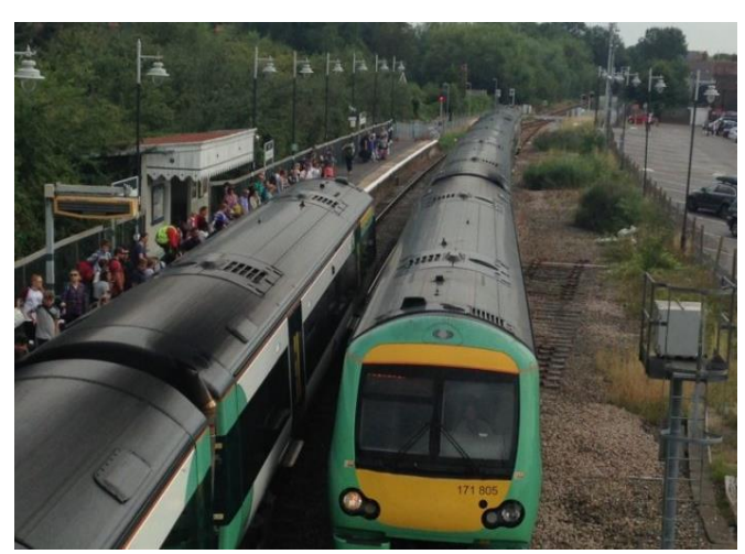
Summer 2018 weekend at Rye. Note 4-car to Eastbourne (r)

GTR's summer timetable 23 for "Ashford International to Hastings and Eastbourne" now for the first time includes all of the East Coastway stations served by the MarshLink trains, thanks to a few quiet words in the right places at the right time — what a neighbouring Railfuture branch's Chairman dubs 'tactical lobbying'. It therefore reflects the full new Ashford International-Eastbourne service negotiated with GTR by members of the Hastings and Rother Rail Users' Alliance and introduced successfully last May, with tweaks in December responding to commuters' feedback. That is now an important marketing tool, presenting the complete service offer in a 'single source of truth'.