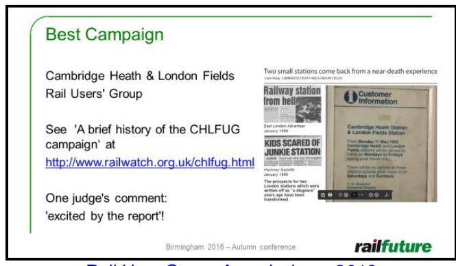
Rail User Group Award winner 2016

Regular readers will be familiar with reports from the <u>Cambridge Heath and London Fields Rail Users Group</u> which is affiliated to Railfuture, although the previous one was a couple of years ago in <u>September 2017</u>.