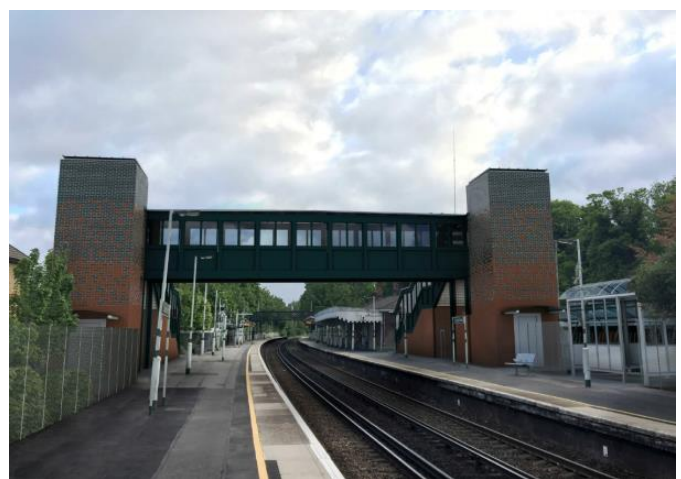
Coulsdon South is one of three south London stations to benefit

As an example of one of those '24 already ongoing' the scheme at <u>Coulsdon South</u> (2017/18 usage 1.4 million) started in late-May, completion anticipated early-2020.