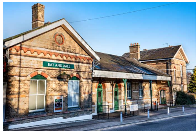
Bat and Ball station, Sevenoaks: showcase restoration

Spearheaded by <u>Sevenoaks Town Council</u> Thameslinkserved yet Southeastern-managed <u>Bat and Ball station</u> has undergone a remarkable transformation.