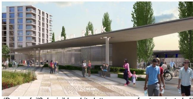
(Design fail? Invisible white letters, on roof set against sky!)

A new station on the c2c line in the London Borough of Havering, between Dagenham Dock and Rainham, Beam Park station is expected to open in May 2022 to serve 3000 homes in the new Beam Park development which has recently received planning permission. Train operator c2c is due to add to its current fleet, 80 x 4-car Electrostar trains, with six new 10-car Aventra trains to replace the six 4-car class 387s, adding sorely-needed capacity to its network by the end of 2021. While the Purfleet-Rainham-Dagenham Dock-Barking route has a weekday peak periods quarter-hourly service, that is halved at all other times. That is not an attractive turnup-and-go metro-style service for new, never mind existing, residents living within easy access of the A13. Improvement prospects may however be constrained by the additional Overground services using the same tracks east of Barking, and increased rail freight from DP World's London Gateway port, and Tilbury, with no other route to connect them to the national rail network.