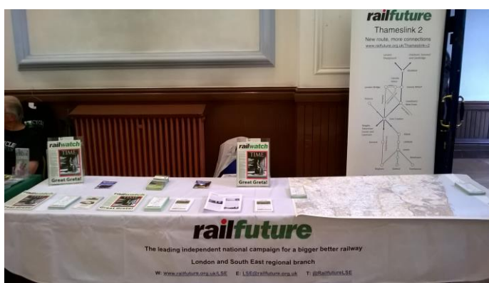
A stall in the hall – at the annual Lewes Societies Fair.

The imminent public consultation on Transport for the South East's draft Transport Strategy 2050 follows stakeholder workshops in which Railfuture participated. It will be the opportunity to establish a new rail-served 'LUcky Garden Village' – part of an emerging Brighton-Falmer-Lewes-Uckfield-Crowborough-Tunbridge Wells economic corridor – with a new sub-national transport body. See p.7 for an October talk and 5 drop-in events.