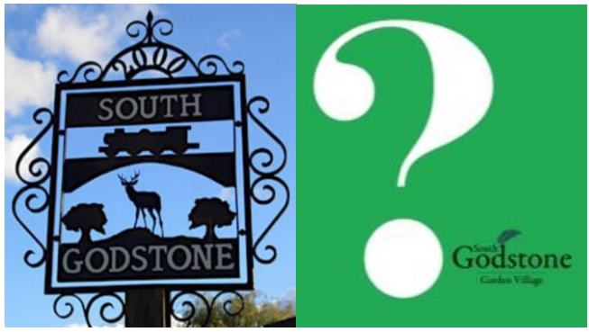
New Garden Community for Surrey, by rail station

In the meantime housing demand pressures continue. On 27 June 2019 the MHCLG confirmed to Tandridge District Council's Chief Executive that, following a competitive bidding process, South Godstone is to be one of 19 Garden Villages selected to join the Garden Communities Programme following last summer's prospectus (reported a year ago in p.4 of railse no.141) This confirmation came a year after a presentation to Council Members: 'South Godstone Village Extension'.