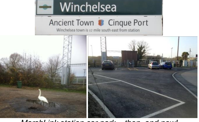
MarshLink station car park - then, and now!