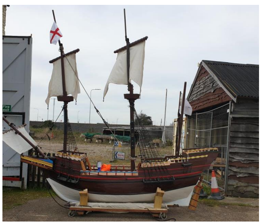
"All aboard!" Community Rail in the city floats my boat!

The Essex and South Suffolk CRP had perhaps one of the more unusual attention-seeking displays this year!