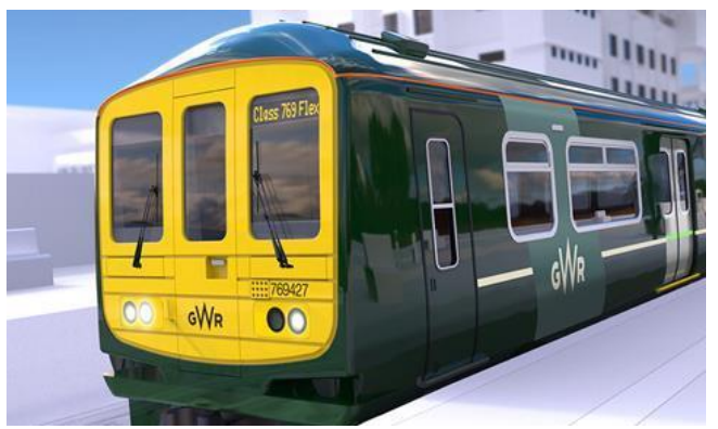
Ex-Thameslink tri-mode 'Flex' to supercede Turbostars

May 2020 is when Great Western Railway are planning to add a third hourly train along the North Downs line, making it the second to run limited-stop in each hour between Reading and Gatwick Airport via Redhill. This is a franchise commitment which will proceed subject to timely completion of any line crossing upgrades which may be necessary to ensure the railway's safe operation. County Councils as the highway authorities are responsible for addressing any highways issues.