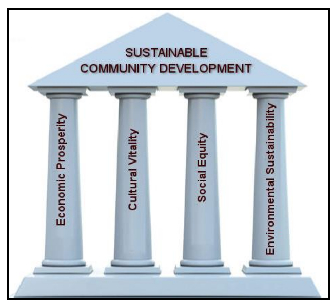
Community Rail's 4 pillars akin to this characterisation