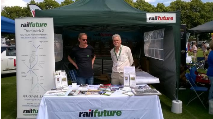
"On Luxford Field" – taking the argument to Uckfield at the annual Uckfield Festival's 'Big Day' in July.

Four contrasting images on this page paint a picture of some different styles of campaigning / lobbying / negotiating / influencing for our bigger better railway.