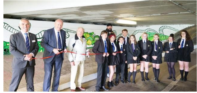
<u>Damian Green MP (2<sup>nd</sup> left) celebrates second mural</u> by artist Lionel Stanhope in Newtown Road underpass.