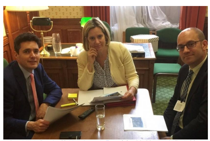
Bexhill & Battle (I) Hastings & Rye (c) with Network Rail (r)

Theme for the visit to East Coastway and MarshLink was "Rail connectivity and the area economy." It brought together community, business and political representatives and came a year after the Railfuture-inspired May 2018 timetable changes, tweaked in the two since. Their success in improving connectivity, despite the limits of existing infrastructure and rolling stock, has highlighted the next challenge: additional capacity, as the twin pillar on which vulnerable local economies rely. This summer's, sadly unsuccessful, experiment with 'hot-weather specials' to respond to short-term needs of the visitor economy has reinforced the need for such enhancements to be contractualised.