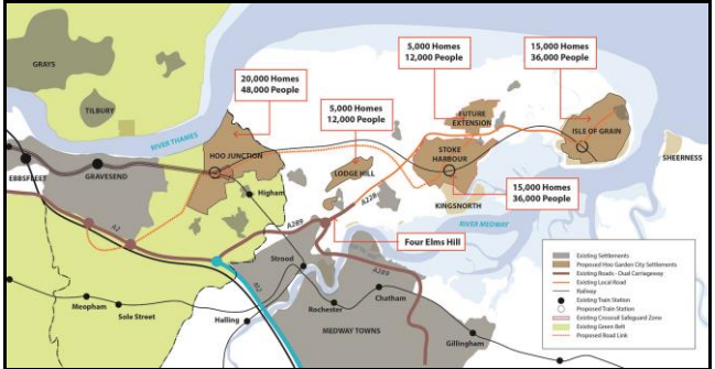
Masterplan from <u>Shelter for Wolfson Economics Prize</u>, 2014 See a summary and full report for <u>Stoke Harbour Garden City</u> 60,000 new homes / 144,000 people would need trains!

Medway Council 's consultation on "<u>Planning for growth on the Hoo Peninsula</u>" will now close on Monday 11 May (extended from Friday 17 April).