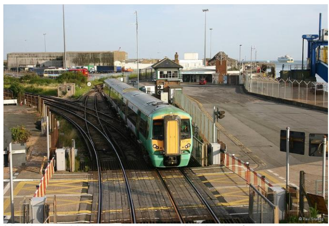
Newhaven Harbour level crossing in the foreground, and the signal box, have both closed since completion of Network Rail's <u>Lewes to Seaford re-signalling</u> project.

~ responded to the Department for Transport 's consultation on Network Rail's proposed Closure of Newhaven Marine station which ended on 19 April. No more ghost trains; click class 313 or class 377 to watch!