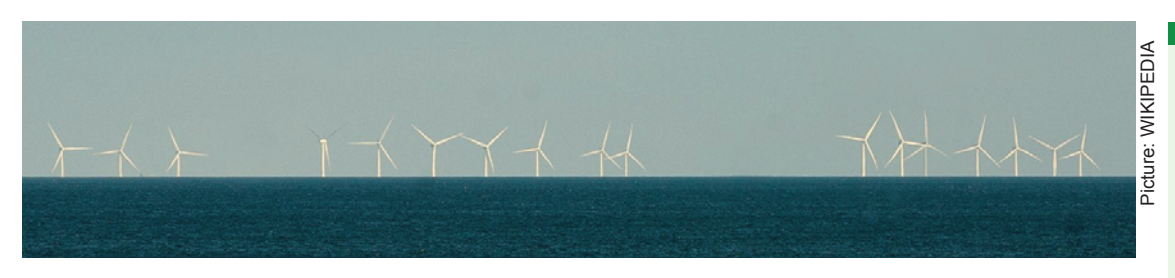
Hornsea wind farm, being built by the Danish multinational company Orsted off the Yorkshire coast, is expected to become the largest offshore wind farm in the world