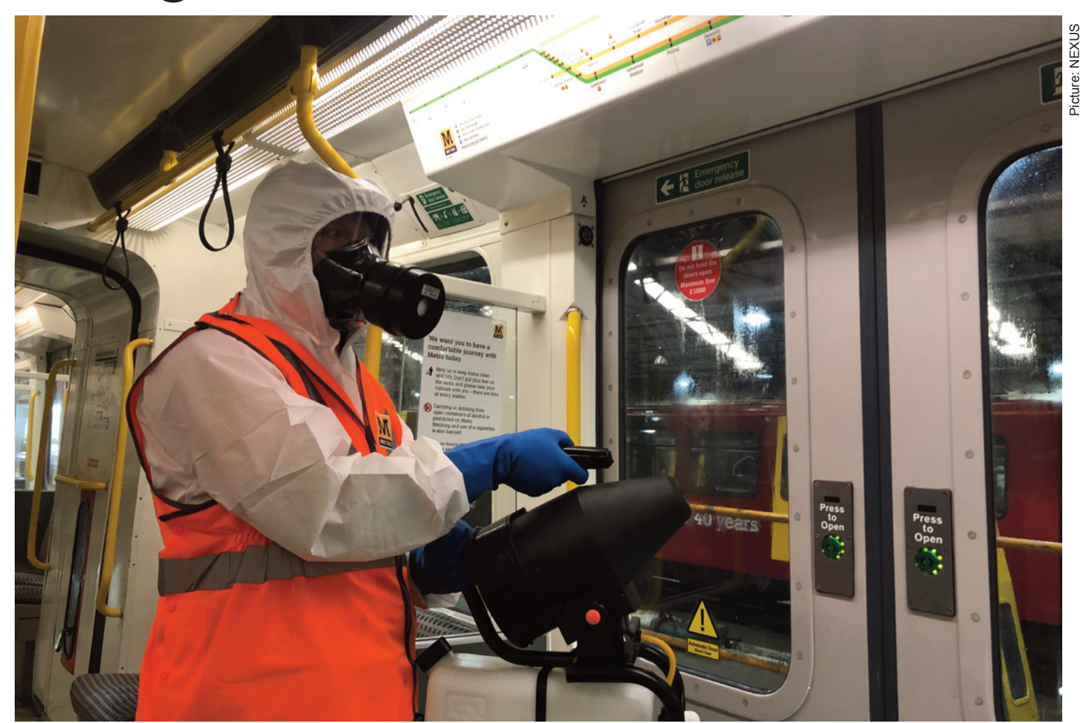
KEEP IT CLEAN: Tyne and Wear Metro staff started using a special disinfectant in June to give passengers the confidence to use its trains

Keeping trains clean will be crucial in persuading people to return to the railway. Nexus, the public body which owns and manages Tyne and Wear Metro, said it was using a new, longer-lasting cleaning agent that would provide anti-viral protection for up to 30 days, meeting the Government's Covid-secure standard. The disinfectant is being sprayed in passenger areas and drivers' cabs.