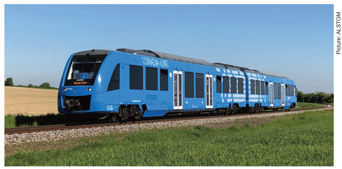
Powered by hydrogen, the Alstom Coradia iLint has completed 18 months of passenger service in Lower Saxony, and ran trials in the Netherlands earlier this year

Where electrification is not justified, battery traction and hydrogen fuel cells are regarded as the only technologies likely to be available for widespread adoption by