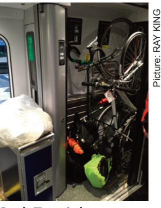
Bad: Too tight on