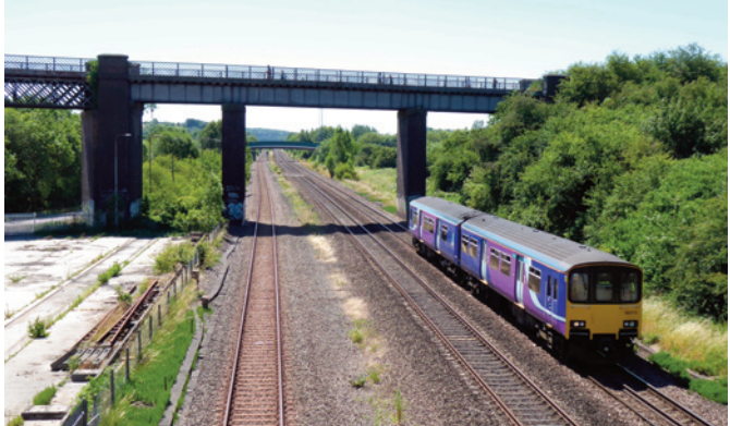
trust that the publication of its reports will not be delayed too long by the present Covid-19 crisis. A 1980s-built diesel Sprinter, under the Erewash valley's historic Bennerley viaduct in 2018

One immediate factor in the background of such decisions is that around a thousand diesel vehicles in the Sprinter fleets will be reaching 40 years old in 2026-31. Decisions regarding their replacement need to be taken by 2024 if the procurement of new, decarbonised vehicles is to be done in an orderly manner. We await the group's findings with considerable interest, and trust that the publication of its reports will not be delayed too