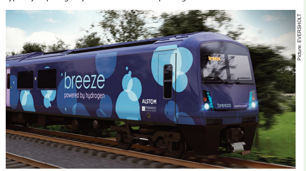
Eversholt's Breeze hydrogen train, based on a class 321 electric multiple unit

As a fuel, one litre of hydrogen contains much less energy than a litre of diesel fuel, even when compressed to 350bar for storage. This is reflected in the energy density of the two fuels being quoted as 4.6MJ/litre for hydrogen and 35.8MJ/litre for diesel fuel. Hence hydrogen needs eight times the storage volume of diesel fuel, with all the implications that that brings for the size of vehicle fuel tanks, and the distribution of hydrogen fuel to depots. Each of the processes in a hydrogen fuel cell has its own efficiency. Production of hydrogen by electrolysis is quoted as 68% efficient, then compressing it for storage at 350bar takes 6% of its chemical energy, while the typical efficiency of the fuel cell itself is quoted as 52%, giving an overall cycle energy around 33%. In other words, it takes 3kW of electricity to produce 1kW of power at the wheel in a fuel cell system, compared with a straight electric system typically requiring only 1.2kW of electrical input to give the same 1kW at the wheel