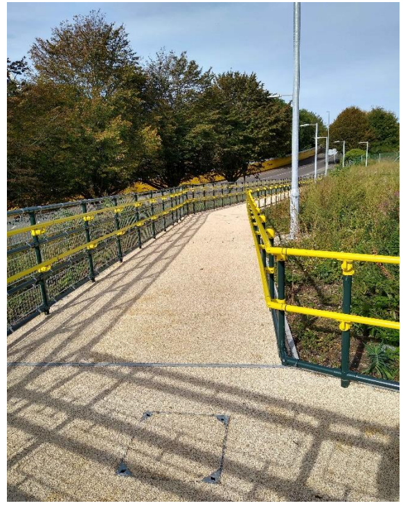
But what about Dorchester South?

Technically, both platforms are DDA accessible. The problem is that the Weymouth-bound platform enables you to leave the station via a gateway to be deposited in a residential road on the wrong side of the tracks for the town centre (see picture on right).