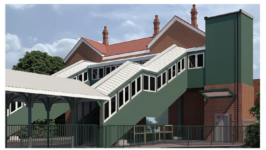
Artist's impression of Eridge from June 2021

For a station with modest usage, East Sussex's Eridge has had good investment in recent years, culminating in the <u>official opening</u> on 16<sup>th</sup> February by the latest Rail Minister of the new lift to the bi-directional mainline platform. Earlier infrastructure enhancements were the platform extension for 10-car Turbostar / 12-car Electrostar trains and more recently the new footbridge.