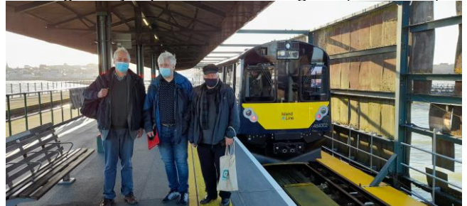
Three of your regional branch committee

Fieldwork for technical research, or indulgence in a '12<sup>th</sup>-night' day trip to the Isle of Wight? (no BYOB!)