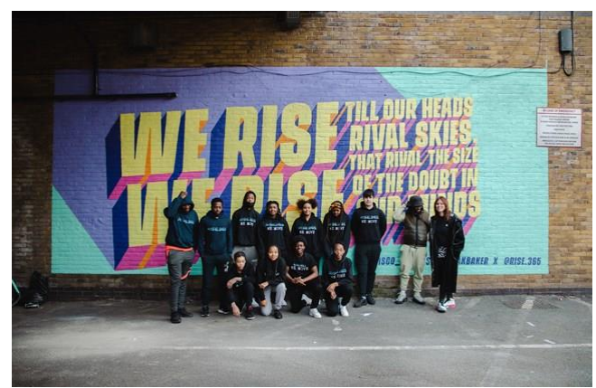
Hackney Downs community joins together for a mural.