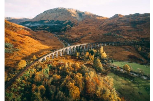
In late-January Network Rail published their 115-page third Adaptation Report.

Changes to our world's climate are continuing, as they've been doing for millennia, for different reasons, including anthropogenic causes since about 1830 and evidently now at an accelerating pace. As a result, both the frequency and the severity of disruptive weather impacting our railway's infrastructure and services are increasing, and our London & South East region has had and continues to have at least its fair share of such disruptions. Risk analysis points to reducing both, by adaptation and by mitigation but, when applied to Victorian rail infrastructure, it's costly!