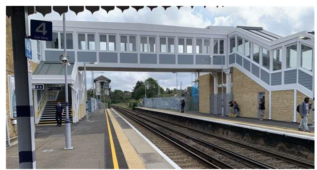
Canterbury East, where the new lifts and footbridge were opened officially in late-November after being opened to the public in time for last year's August bank holiday weekend.

Elaborating, for footfall the pre-pandemic data for 2019-20 is a more reliable indicator of long-term usage over the life-span of an investment in step-free access facilities. Gaps in accessibility on the network can also be seen as outliers where communities suffer from the furthest / most difficult distance to a step-free station. Not a formal criterion this but our evidence of public / stakeholder support would add value to the assessment. Finally, in a similar way that A4A in CP6 included a number of schemes brought forward from CP5 (having been 'paused' by the Hendy Review) any of the now 85 already-funded schemes for CP6 making no or tediously-slow progress should be identified.