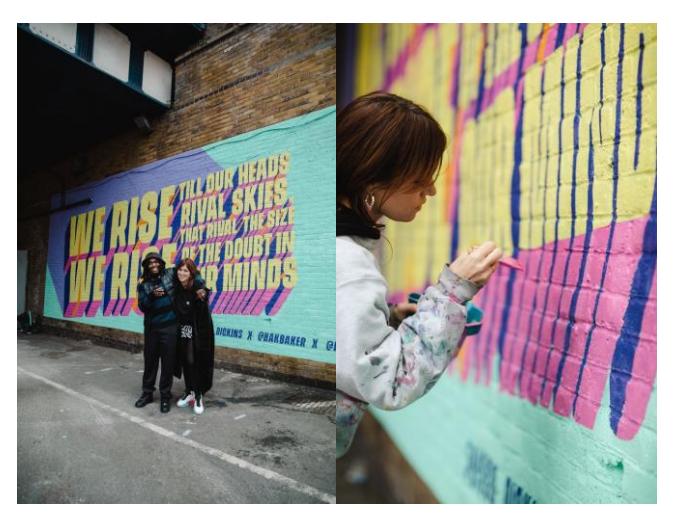
SE London, summer 2021