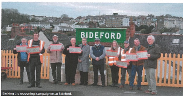
Backing the reopening: campaigners at Bideford.