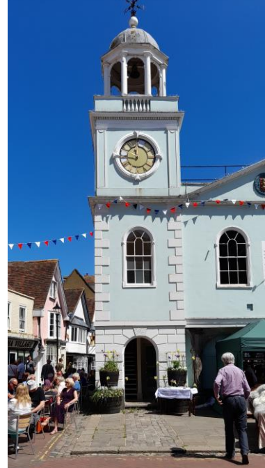
"through that door and up those stairs, Sir"

and our Kent Division's mid-May meeting coincided! We were up in the Council Chamber of the Guildhall.