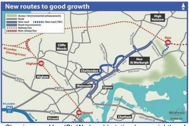
Showing new Hoo (St. Werburgh) station (upper right) and currently-unplanned new chord (upper left)

Meanwhile on the south side of the Thames Estuary we see a planned development of 12,000 new homes, which already has a freight-only line running through it, struggling within a limited budget to deliver the infrastructure upgrade required for even the most pared-back passenger service offering, never mind exploit the potential to create a choice of passenger service destinations and also a London-avoiding route for freight with a short new chord.