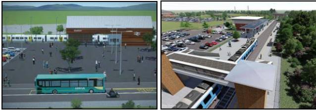
Future Hoo St. Werburgh station

If Railfuture and its members are serious about what they stand for, this in Medway is The Big One – now.