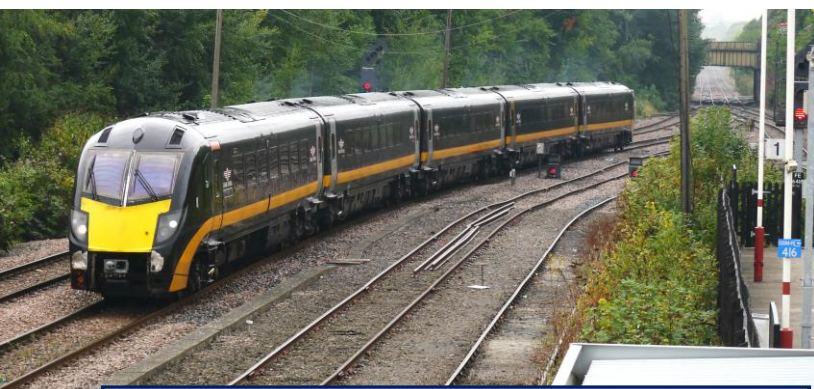
Reprising our YRC58 shot, Grand Central train by-passes Knottingley (platforms on right). To serve this station Askern trains would need at least one new platform. Note tracks in foreground accessing traction depot would require adjustment.