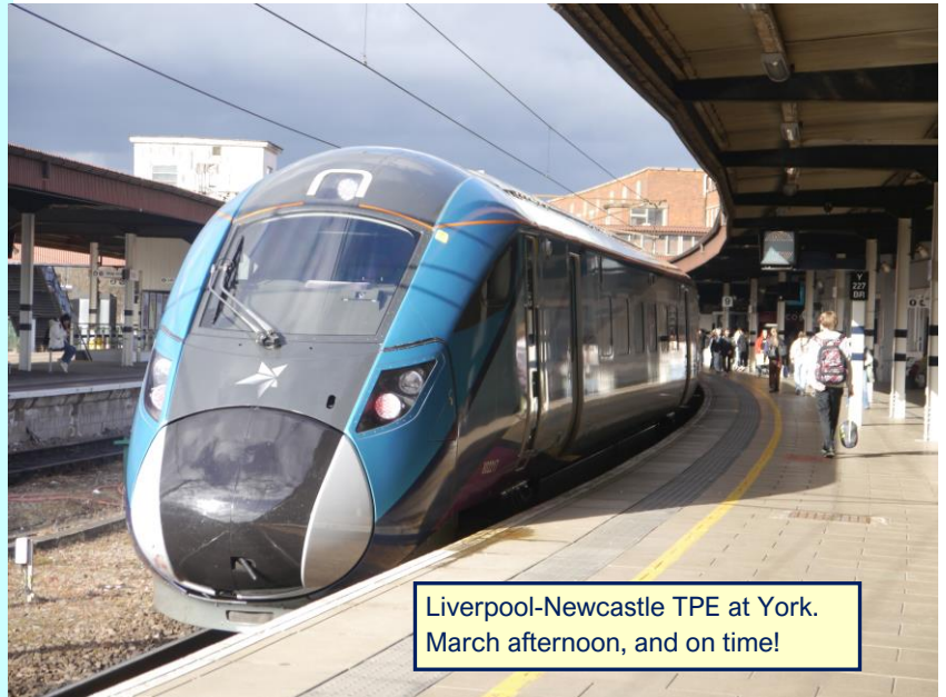
Liverpool-Newcastle TPE at York. March afternoon, and on time!

The last three months have been both good and bad for the railway. Good in that passenger numbers have continued to rise and according to the Rail Industry Association (RIA), were 90% to 98% of pre-Covid levels on every single day in the second half of January. And good in that the Secretary of State's Bradshaw lecture was generally well received, not least for its recognition that rail freight must grow. But also bad – again for two reasons: