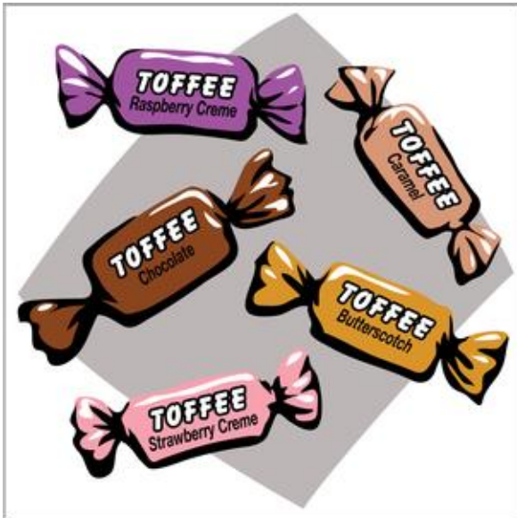
Railfuture's TOFI Test (The Opportunities For Influence)

As an independent campaigning organisation of volunteers, with limited capacity if not capability, the only power we have is soft – the power of persuasion.