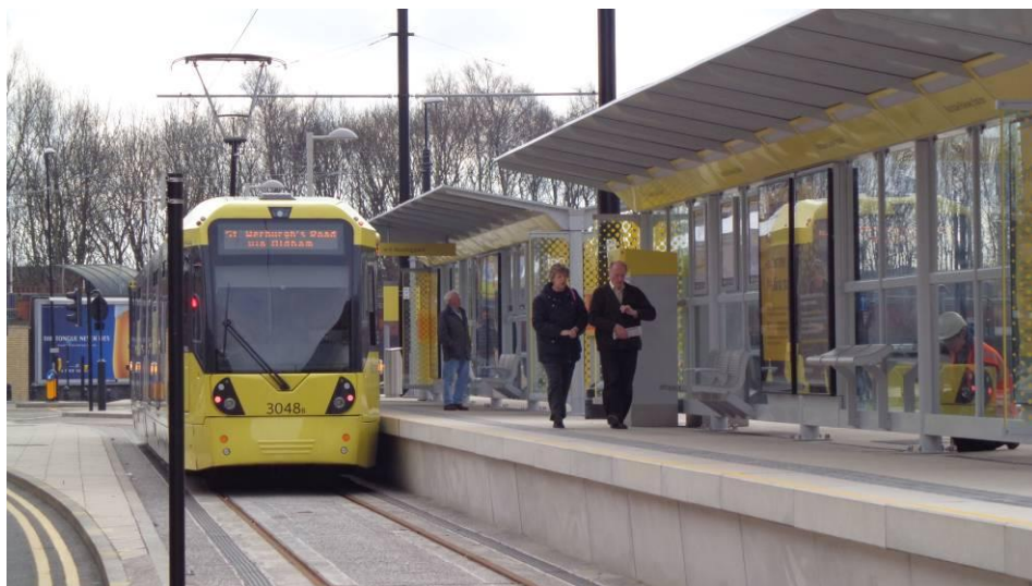
Metrolink tram 3048 awaits departure to St Werberghs Road at Rochdale Railway station.