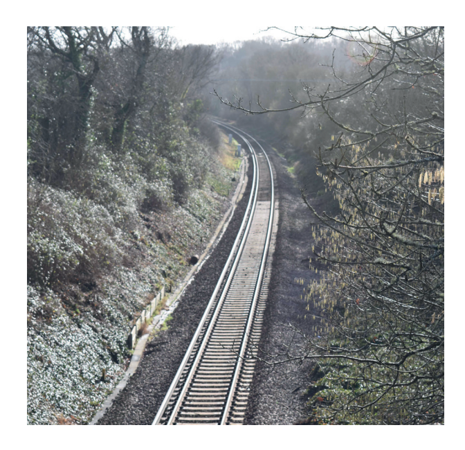
The single track Fareham to Botley railway line looking South from the footbridge just North of Welborne

Welborne Station could be served by the hourly each way train Portsmouth-Fareham-Eastleigh-Winchester-Basingstoke-Waterloo (half hourly at peak times) enabling fast journeys to and from Portsmouth, Eastleigh, Winchester and Southampton (change at Fareham or Eastleigh). Hedge End Station, opened in 1990 and served by these trains, is used by over 500,000 passengers a year with frequent journeys to Eastleigh and Winchester for education and employment.