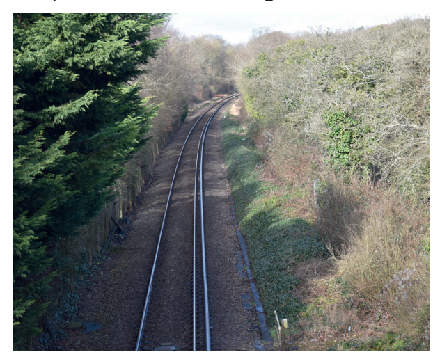
The single track Fareham to Botley railway line looking North from Funtley Road bridge just South of Welborne

By switching many journeys from car to train the station would take many cars off the road and prevent road traffic congestion.