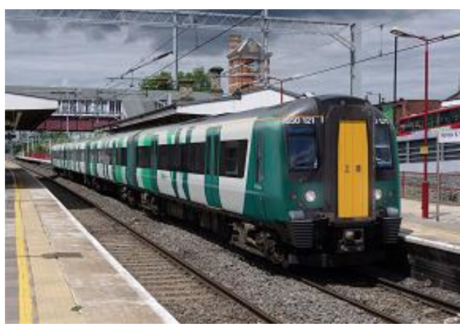
New livery for London Northwestern

That for WMR has been agreed with West Midlands Rail and should be the same irrespective of future franchise holder.