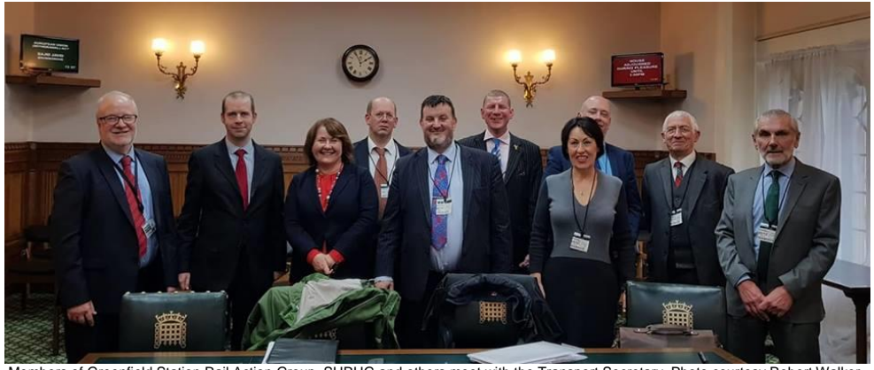
Members of Greenfield Station Rail Action Group, SHRUG and others meet with the Transport Secretary.

The Stalybridge – Huddersfield Rail User Group (and others) met with the Secretary of State for Transport on December 5<sup>th</sup> in London with the aim of airing their views on the timetable changes that have severely affected services on their line since May 2018. They also met with the Transport Minister Andrew Jones and separately met with