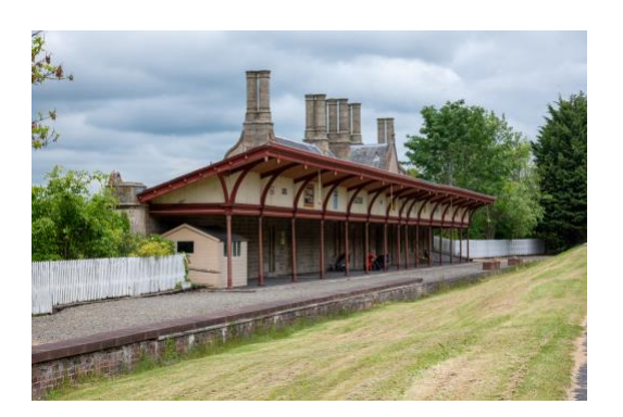
Melrose Station was closed in 1969 and a bypass was built over most of the railway alignment. However, the station building and up platform remain with just enough space for a single track line.

access to shops and leisure facilities and access to schools and colleges of further education. Operationally the Waverley line also provided a diversionary Anglo-Scottish route in the event of any mishaps affecting the West Coast Main Line. In a scathing reflection about Beeching, and Ernest Marples - the now discredited Transport Minister who encouraged Beeching to be ruthless in his pruning of the