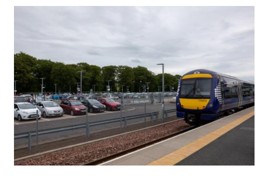
A class 170 at Tweedbank Station. Note the large, and nearly full, car park. It's only a short walk from the platform end to the bus stop, café and cycle sheds.

Simon, interestingly, referred back to the original closure of the old Waverley route between Edinburgh and Carlisle in 1969 – the present 35 miles Borders' Rail comprises the northern end of that Waverley line. He recalls that there were sustained protests