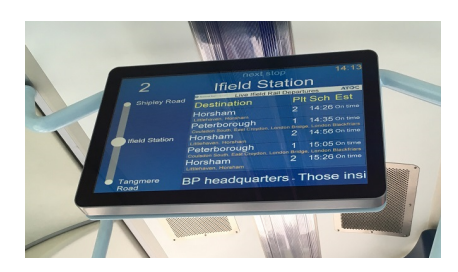
Observed during our field work, Metrobus in Crawley have started displaying live train times on a number of their buses.

We will keep you updated as this work progresses and will of course share these ideas as they begin to emerge. In the meantime, please don't hesitate to get in touch if there is anything you'd like to raise with us.