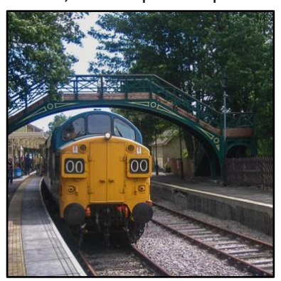
A Class 37 terminates at Stanhope in the very early days of the preserved railway.

So, who are the new owners? On their Facebook page the Auckland Project describe themselves as "a heritage, arts and faith destination located in Bishop Auckland in North East England" with "a mission to revitalise the future of this former industrial town through employment, training and educational opportunities." Amongst their initial ambitions was to "transform Auckland Castle, once a private palace for England's only