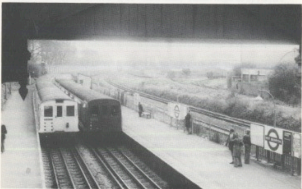
W. Brompton District Line with W. London Line running parallel