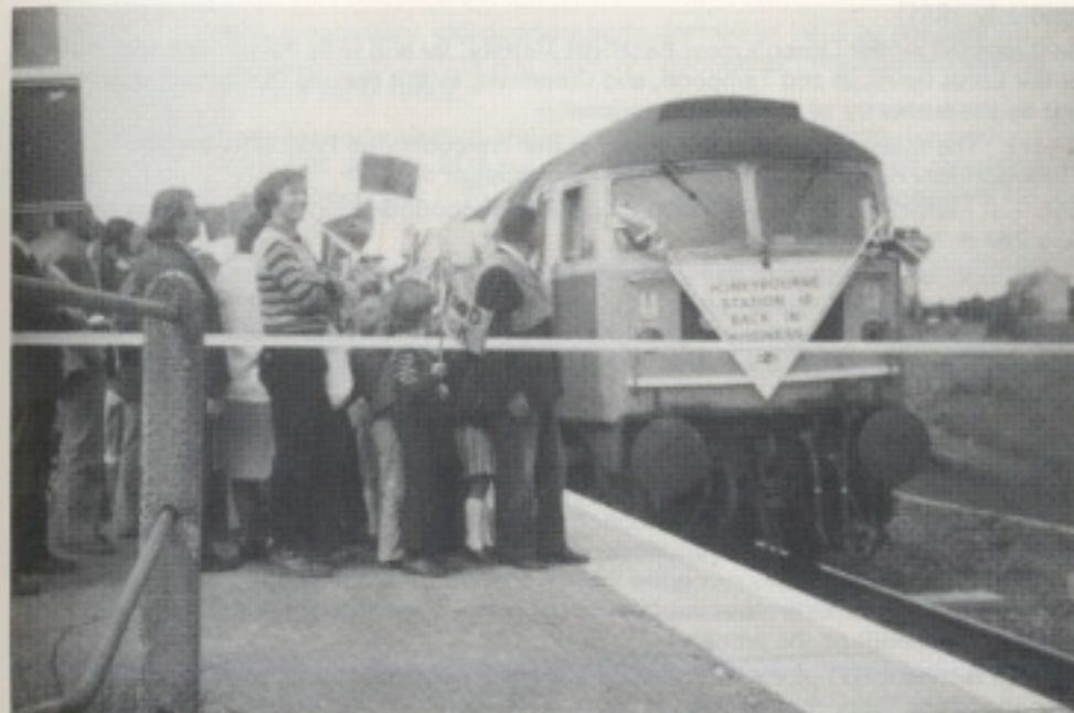
Honeybourne re-opening on Worcester — Oxford Line