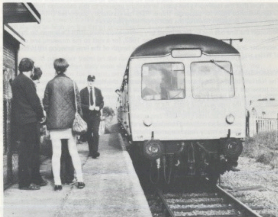
Passengers wait at Kimberley Park for the RDS/WyDFRAC special from Dereham to Felixstowe, which draws in on Sunday August 22nd 1982

Although the running of the special trains has been the activity that has kept this campaign most in the public eye, it has also spent considerable time on research and well-documented representations to the various authorities, putting the case for reopening. Both RDS and WyDFRAC were invited to participate in the hearings into the Norfolk Structure Plan, which chose Dereham and Fakenham as two of the six market towns in the county earmarked for growth.