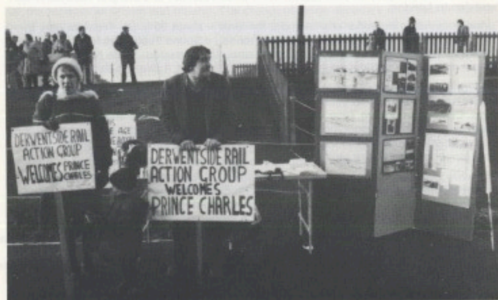
Prince Charles' visit to Consett

In 1980 a Derwentside Rail Action Group was set up, to press for a restored rail passenger service on this 14-mile line, with local bus services integrated with it. Such a rail service would, in turn, feed into the Tyne & Wear Metro and Inter-City services at Newcastle. Trains would also serve the substantial centre of Annfield Plain (for superstore) and Beamish Industrial Museum. Three stations could have good park-and-ride facilities; five could be served by buses.