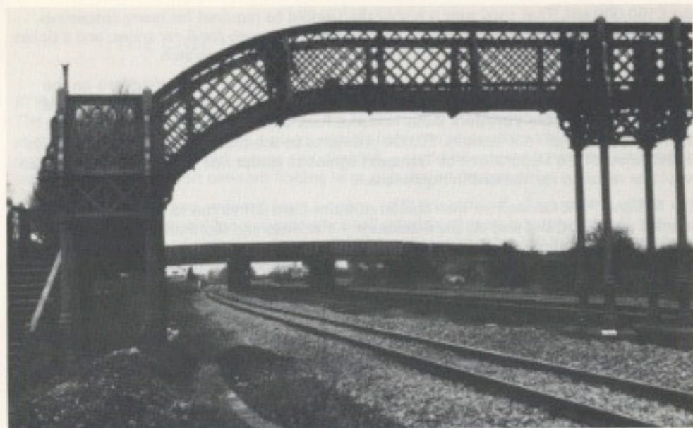
Possible site for Arlesey Station

The Tyne & Wear Metro has shown that a system of light vehicles, similar to tramcars, could be cheaper but still attractive. Indeed, Britain is almost alone among major European countries in having written off the tram for urban and suburban transport (apart from the