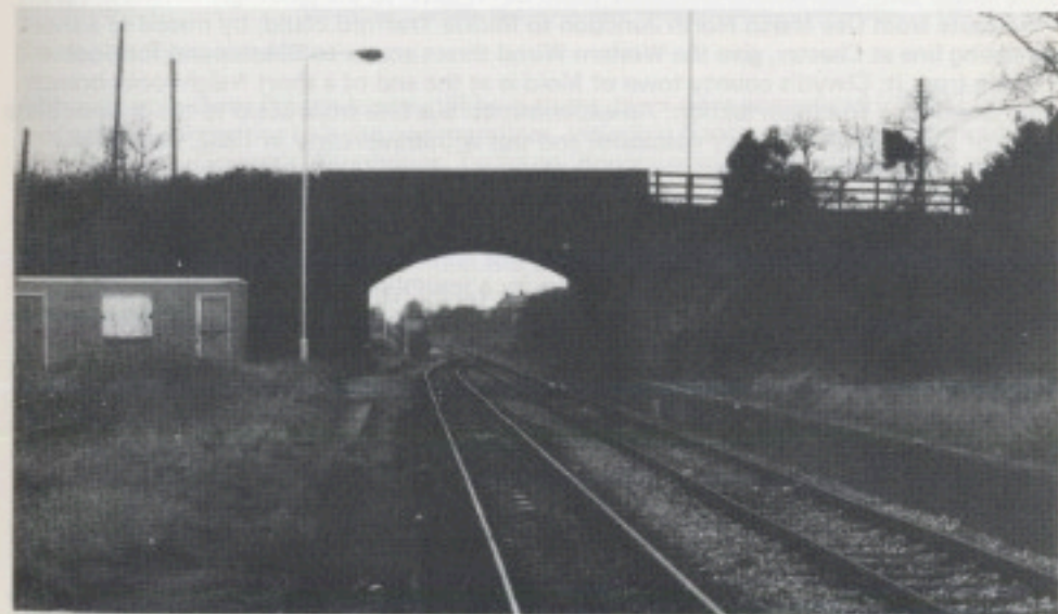
Thame, a station, a line which locals want re-opened