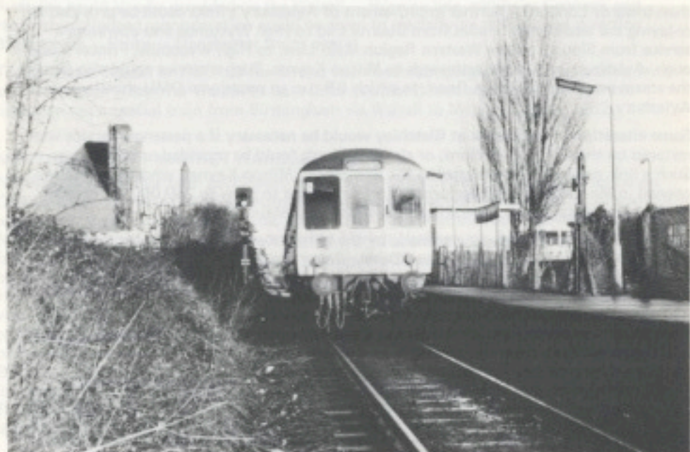
Watford N. on Watford Junction to St. Albans Abbey. Station reopened by Watford Borough

Road station, as from there the walk to City station would only be about 500 yards. Also, this would provide added custom on the branch, originating from a well-populated area of the city.