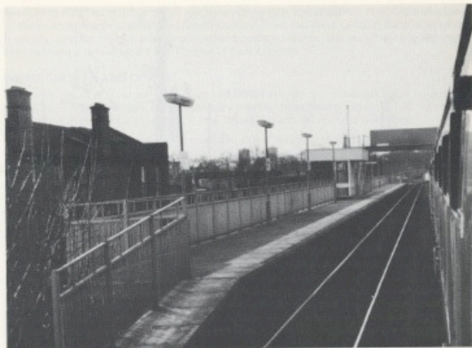
Hackney Wick Station reopened with G.L.C. funding on Woolwich — Camden Road Line

Re-laying of this track, and a restored passenger service over the route would not only give Coatbridge and Airdrie an eastern outlet; it would also serve Bathgate (pop 14,000) where the station is well-sited in relation to the town, and could provide access for Livingston New Town.