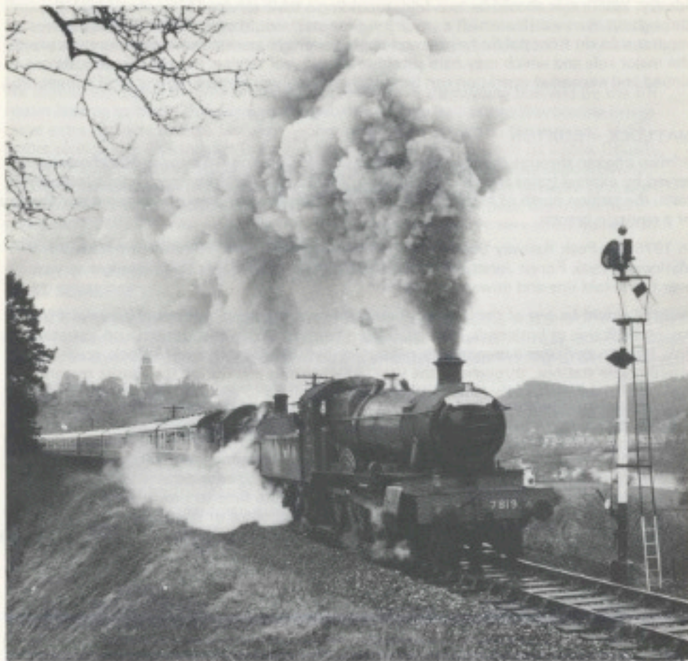
The first public excursion train to depart from Bridgnorth since closure in 1963. St. John's R.C. Primary School's "Severn Valley Crusader" to Paddington, SVR locos 7819 "Hinton Manor" and 46521 on Saturday March 14th 1981.