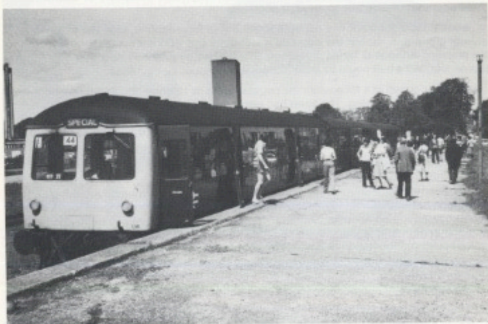
R.D.S. Special from Wisbech to Felixstowe on Sunday June 27th 1982 takes on passengers from the platform in Wisbech Goods Depot. (The passenger station was demolished shortly after closure).

However, this was not the end of the campaign. Further meetings were held locally, every opportunity was taken to raise the question — in Structure Plan and Public Transport Plan consultations for example — and in September 1978, RDS and the action committee chartered a 4-car diesel train to run from Wisbech to Cambridge and filled it with local people. Since then, four more specials have been run — two to Cambridge and one each to Lowestoft and Felixstowe — and well over a thousand local people have used the line on these occasions.