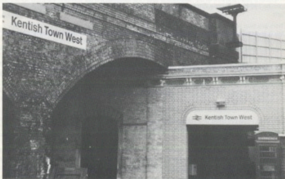
Kentish Town West reopened by G.L.C. in 1981 following fire in 1971, after BR sought permanent closure

Planning authorities should also be encouraged to choose those options for industrial, commercial and mining sites which have rail access, or potential rail access, wherever possible.