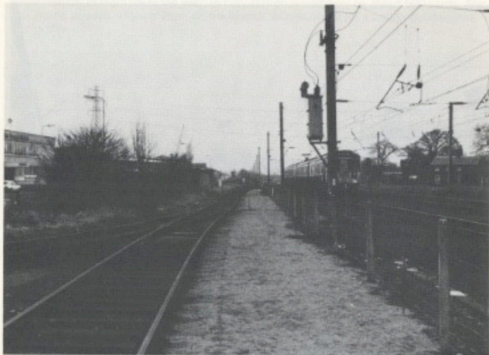
Proposed Welham Green Station site on G. N. main line