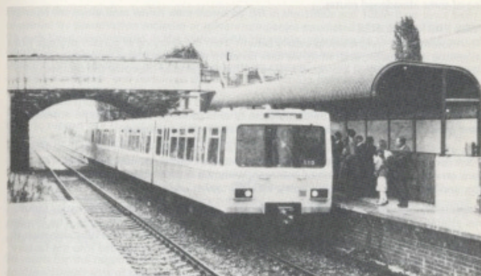
Station on Tyne-side Metro

rather specialised instance at Blackpool). Continental cities like Amsterdam, Gothenburg and Vienna have shown that a modern tramway system can offer fast, convenient, pollution free methods of moving large numbers of people.