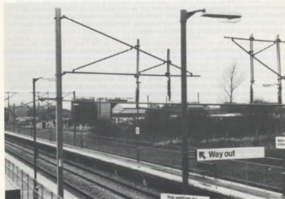
View looking north of the new station at Watton-at-Stone. (Reopened with local support May 1982.