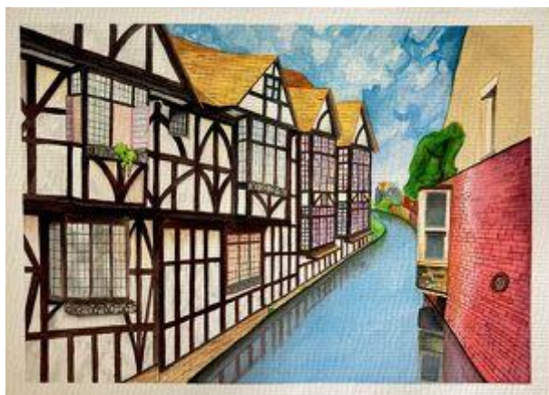
"Where am I?" Kent, with two stations.

At London Waterloo station until Sunday 1 st August and then at Reading station until Sunday 8 th August, Network Rail has launched an exhibition to celebrate the return of rail travel. The Top Twenty winners include several with a London & South East theme.