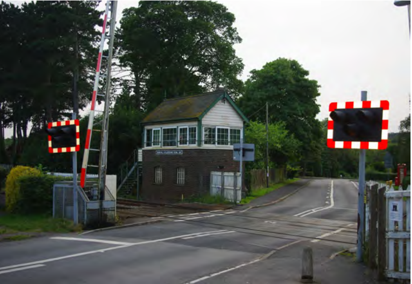
Blakedown Box 1888—2012 The cast nameplate still reads Churchill and Blakedown Signal Box

Next summer will see the abolition of signal boxes at Stourbridge Junction, Blakedown, Kidderminster and Hartlebury, when WMSC takes over from Jewellery Quarter to Droitwich Spa. It will improve headways, so reduce delays and is linked to track alterations for more efficient operating. For example, it will be possible to run directly onto the Severn Valley Railway at Kidderminster, without the double reversal. It also includes resignalling the Round Oak line, in preparation for reopening through to Walsall.