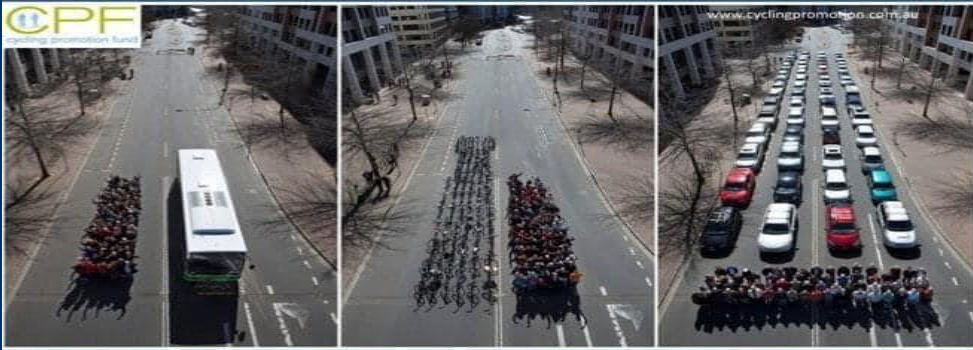
Space Required To Transport 48 People