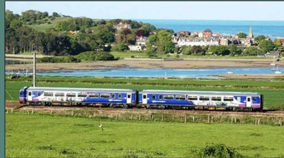
Northern train at Alnmouth.