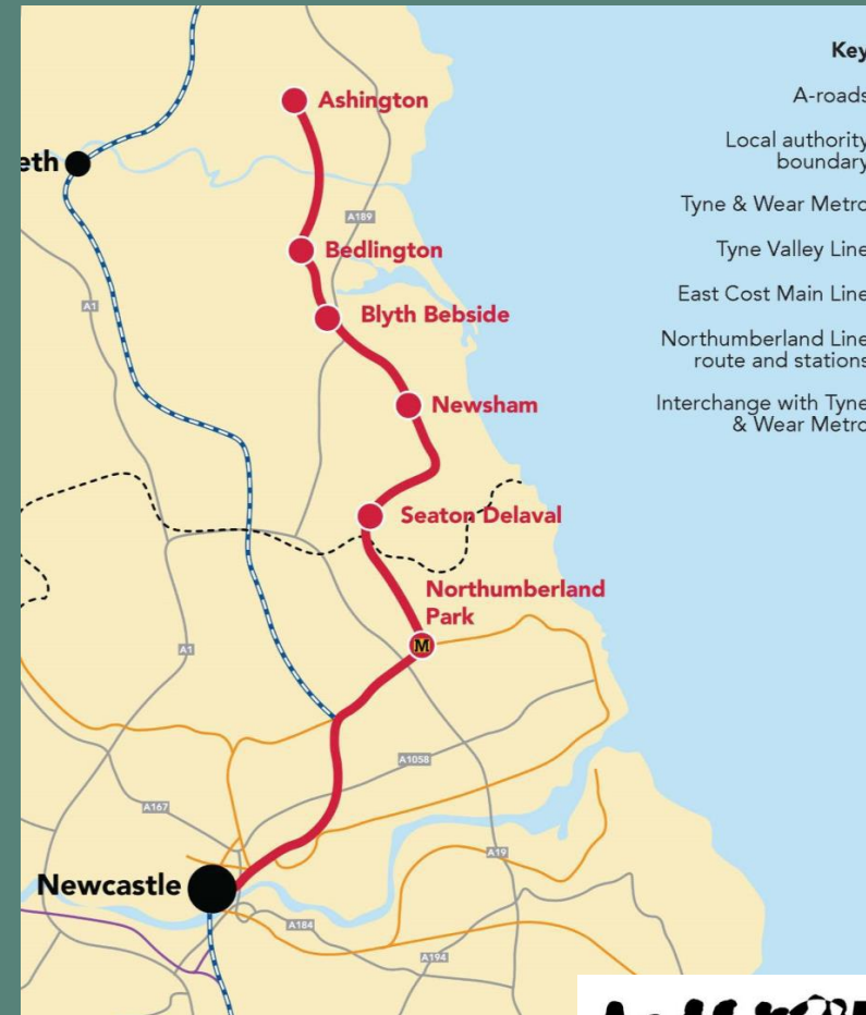
What We're Getting Map credit: NCC