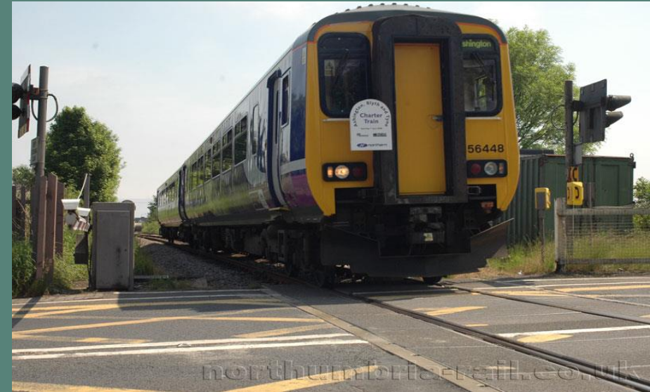
Choppington Crossing.