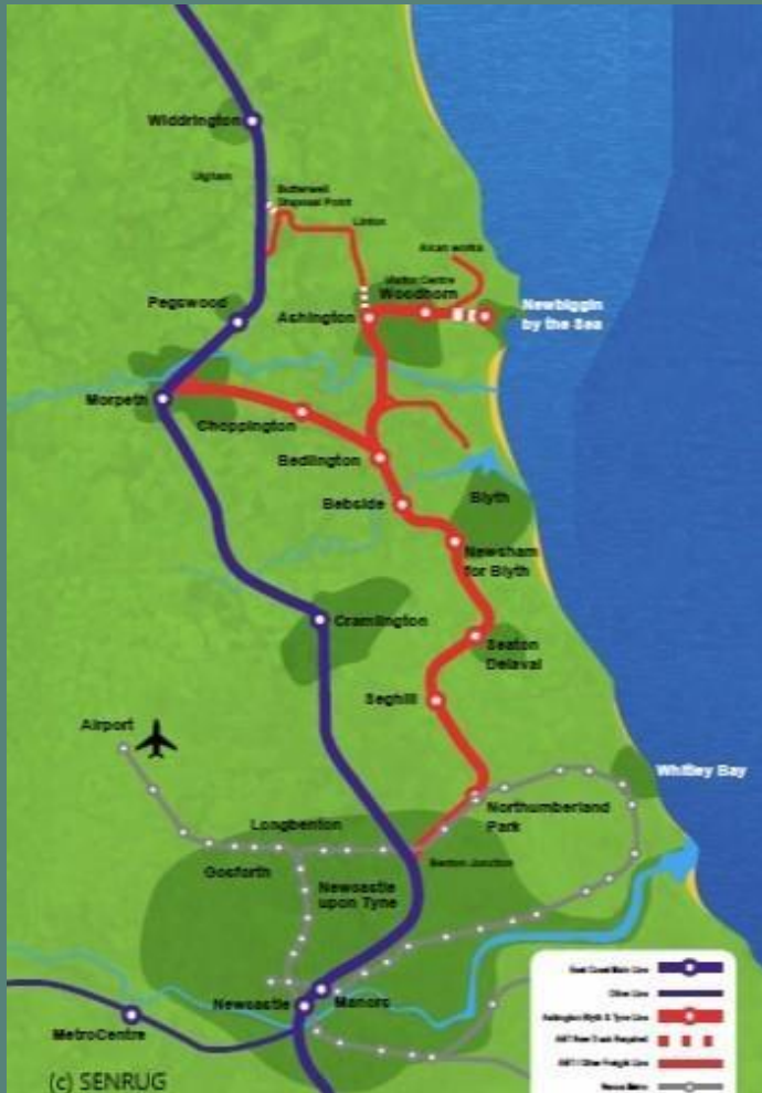
What We Wanted Map credit: SENRUG