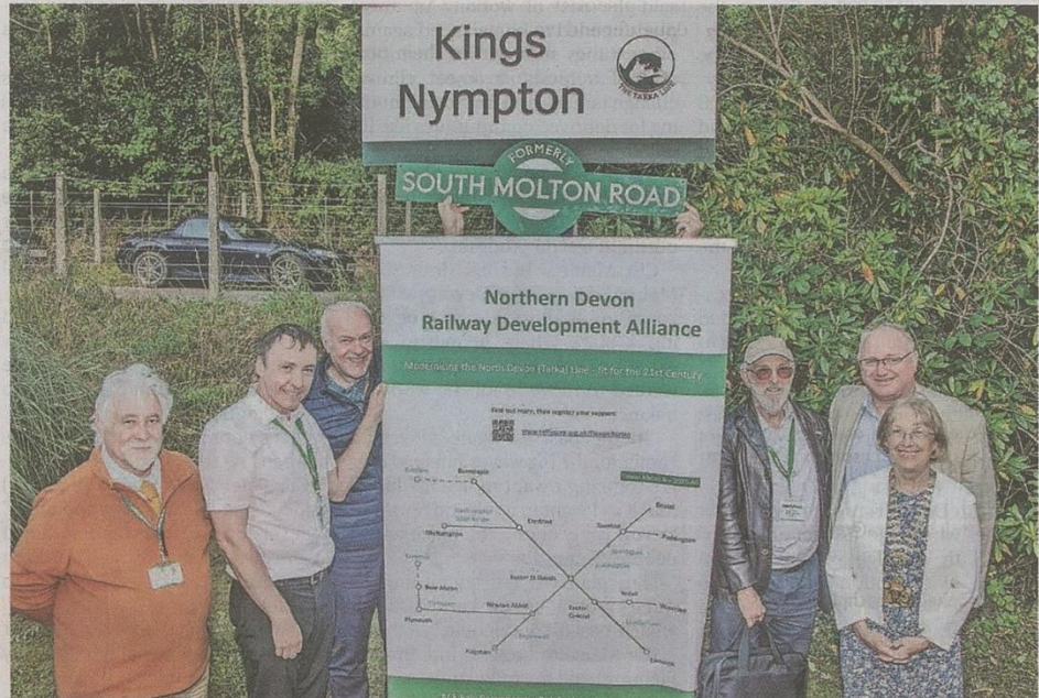
North Devon Railway Development Alliance, campaigners and supporters say Kings Nympton Railway Station needs more trains stopping there in the future and more should serve the Tarka Line

North Devon MP, Ian Roome backed the calls, saying: "The Tarka Line is getting extremely busy. I've asked Network Rail and GWR for a more frequent service, particularly to help students and during the tourist season. The line needs more passing places and more carriages. It's one of the few rail lines in the country where