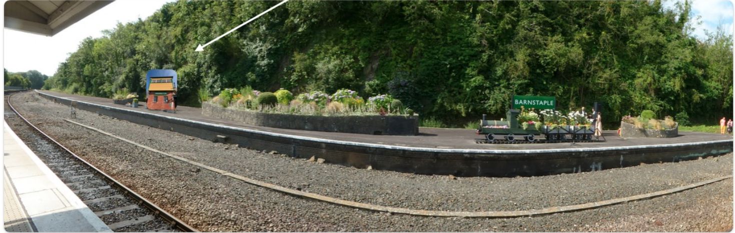
Signal box bug house location

Signal box bug house will be constructed on a base of bricks and timber frame. 1.3m is in keeping with the height of the locomotive planter on platform 2. We would like to call it Barnstaple Junction for historic reasons if agreed.