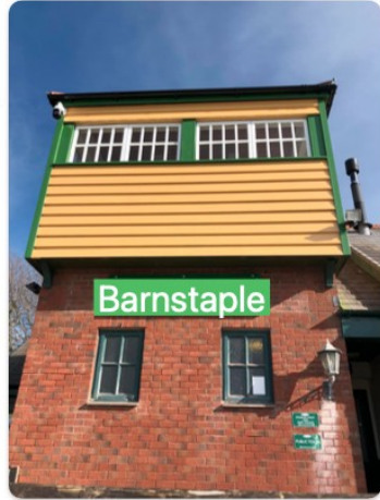
Signal Box bug house