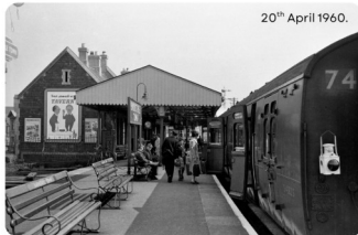
A train from Ilfracombe calls at Barnstaple Town Station.

Trains to Bideford followed in 1855 . This Barnstaple station became Barnstaple Junction in 1874 with the opening of the line to Ilfracombe, the addition of a second platform and footbridge, and another station across the River Taw at Barnstaple Quay, renamed Barnstaple Town in 1886 and relocated in 1898.