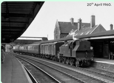
A train from Torrington arriving at Barnstaple Junction.

Trains from Taunton reached Barnstaple at Victoria Road in 1873 then on to Barnstaple Junction in 1887 . In 1924 the station was expanded with platform 2 becoming an island to add platform 3. With the closure of passenger services to Bideford in 1965, Taunton in 1966 and Ilfracombe in 1970 , Barnstaple Junction reverted to Barnstaple in 1970.