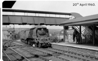
A train from Ilfracombe arriving at Barnstaple Junction.

Trains from Taunton reached Barnstaple at Victoria Road in 1873 then on to Barnstaple Junction in 1887 . In 1924 the station was expanded with platform 2 becoming an island to add platform 3. With the closure of passenger services to Bideford in 1965, Taunton in 1966 and Ilfracombe in 1970 , Barnstaple Junction reverted to Barnstaple in 1970.