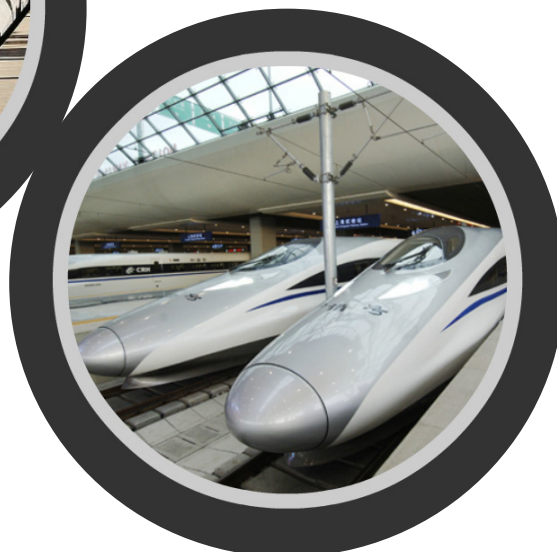
Right: China's Harmony CRH 380A has a maximum operating speed of 235 mph but one train set a record in 2010. They were made by Qingdao Sifang