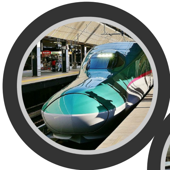
Left: Japan's E5 series Shinkansen Hayabusa trains run at 200mph. They were made by Kawasaki and Hitachi