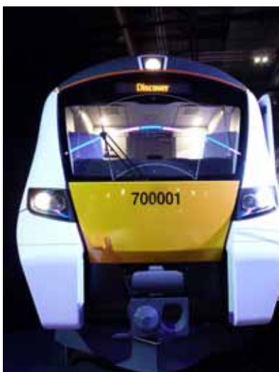
A mock-up of the Thameslink trains to be built by Siemens

The first major competition in the current franchising round was completed on 23 May 2014 with the announcement that the Thameslink, Southern and Great Northern franchise would be operated by Govia Thameslink Railway, a company formed by the Go-Ahead Group and SNCF subsidiary Keolis. The takeover of the combined services, which will be the largest in the country in terms of passenger numbers, will be in two stages with Govia running the Thameslink and Great Northern trains (currently First Capital Connect)