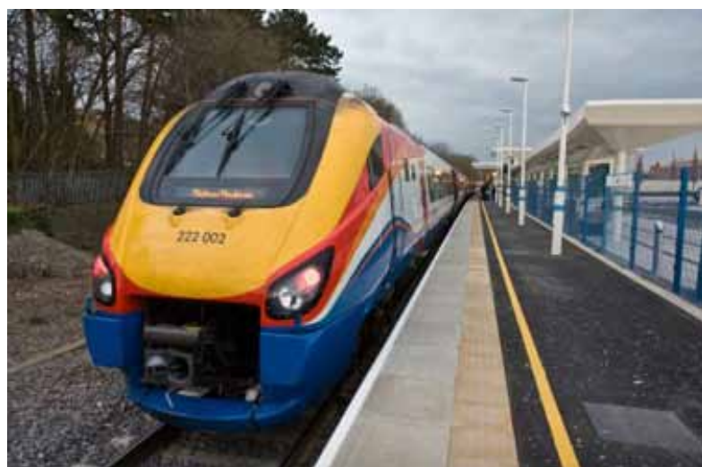
A train at Corby with the destination board Melton Mowbray.

the nearby college who will no longer have to walk round the car park. Local Railfuture members are pleased at the development and are looking forward to ensure that the planned electrification and other developments build on the benefits that the reintroduction of the railway has provided to their town.