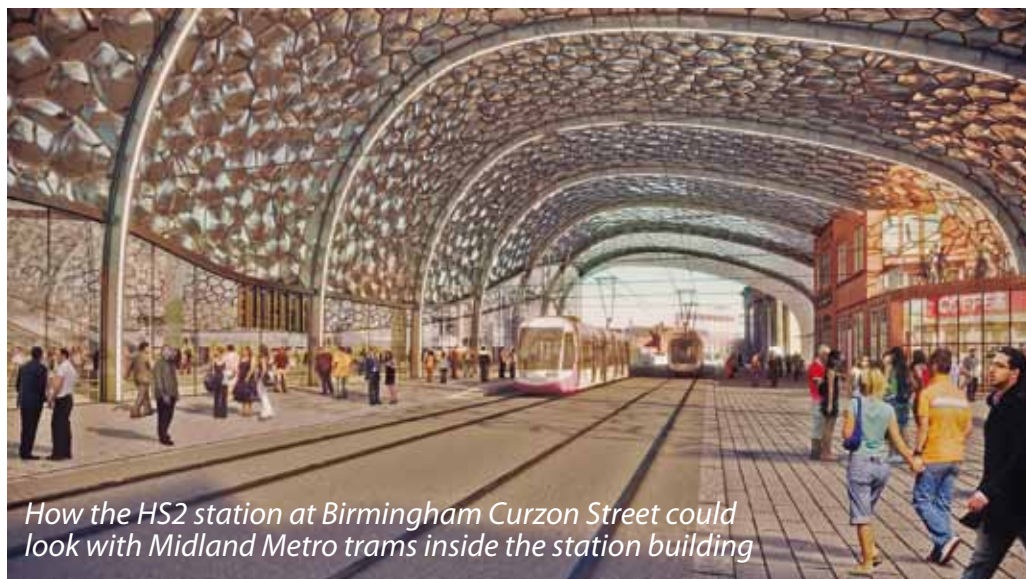
How the HS2 station at Birmingham Curzon Street could look with Midland Metro trams inside the station building