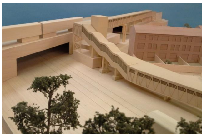
Model of Hackney Interchange looking north-west, with Hackney Central at right, Hackney Downs top centre

The September 2011 issue of railse no.113, found in www.railfuture.org.uk/London+and+South+East+branch+news drew attention to 31 ‘useful transfers’ listed in the GB timetable, 25 of which are in our region and 15 of which are in London. Adjacent stations rather than officially-recognised ‘Interchange stations’ they often afford valuable links for those in the know but unattractive journey times for those who are not. Now one is reality and another is months from becoming so.