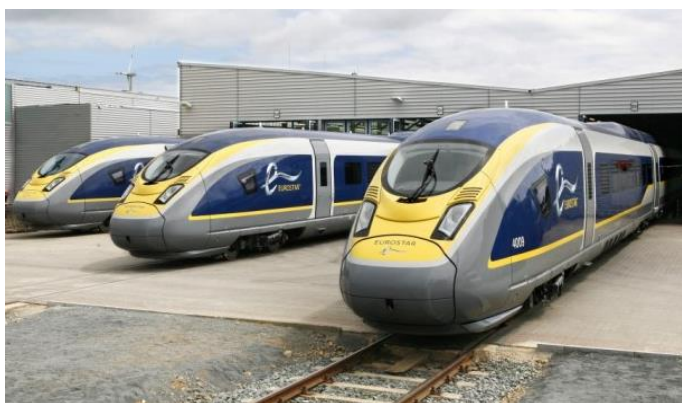
New e320 class 374 for new 200mph Eurostar services to Amsterdam and Cologne in 2016

The prospect of HS2 represents the opportunity for the development of a national High Speed Spine through the next extension of HS1 - from its western portal to Old Oak and far beyond, first with a line to the West Midlands with a spur into Birmingham's Curzon Street.