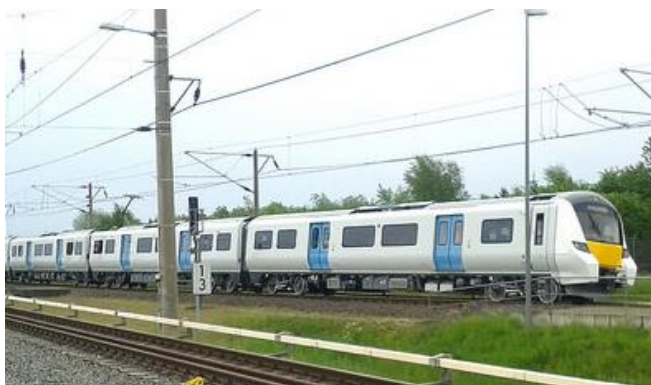
100mph Desiro City for BML – on test in Germany

The Sussex area Route Study covers the Brighton Main Line and connecting routes, plus the dense suburban network of radial routes in south central inner and outer London, and the orbital routes of the West and East London Lines. It notes that the 2019-24 Control Period 6 is after completion of the Thameslink Programme, with additional capacity through the Thameslink Core and its December 2018 timetable increasing usage of the BML itself which unlike central London will not have had any upgrade.