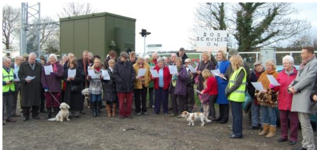
People power at Winchelsea station 7 December 2013

GTR's proposals are initial changes to the off-peak timetable, aligning with the expected post-Thameslink Programme timetable in December 2018. In turn, the changes necessitated by London Bridge rebuilding from 5 January 2015 form the basis for December 2015. The focus then is on Brighton Main Line off-peak services with for example reduced journey times for key Coastway centres and alternate Gatwick Expresses extended non-stop to Brighton. There is strong local disquiet at Redhill about reduced services and connectivity, led by East Surrey Transport Committee. Away from the BML, Southeast on the Seaford branch is to have additional later evening services, and barely a year after the event at Winchelsea station [see railse no.122 for December 2013] local rail user group THWART can barely contain its delight at securing all-day Sunday services for Winchelsea and Three Oaks! However Uckfield line users will be very disappointed by the absence of mention of an earlier first Sunday train. Consultation www.southernrailway.com/ closes on 30 January.