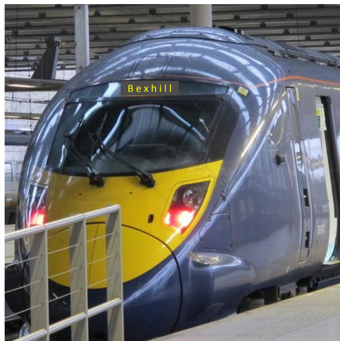
Image: East Sussex Javelin at St.Pancras International

Network Rail's draft 'refresh' of the October 2009 Network RUS [Route Utilisation Strategy] for Electrification is due to be published for consultation early next year. One of our region's un-electrified links – north London's GOBLIN – already has funding committed. Three more are in the Sussex area Route Study, of which Ashford International-Ore is one [Hurst Green-Uckfield and Reading-Reigate being the others].