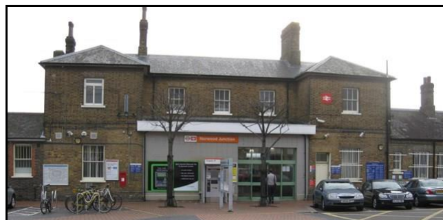
Norwood Junction station – major upgrade planned

Saturday 21 September "Every passenger matters." Railfuture annual national autumn conference, Bristol.