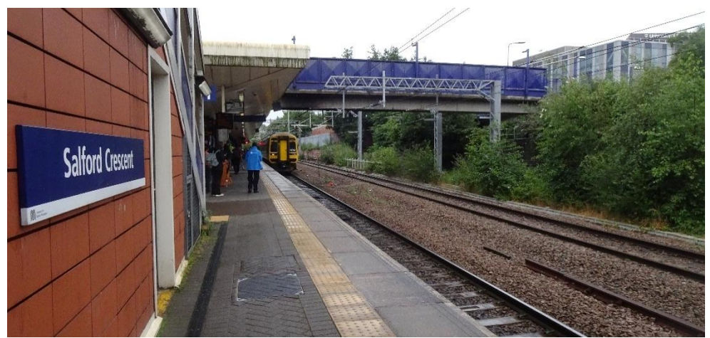
A class 158 bound for Leeds awaits departure from Salford Crescent. Its thought that by re-aligning the track to the right could create space for a third platform.

those who can't or find it very difficult to use TVM's, online or mobile smartphone methods of ticket purchase) are a higher proportion of the population in the North than in South. These group categories are; over 55, disabled or those in social class D/E.