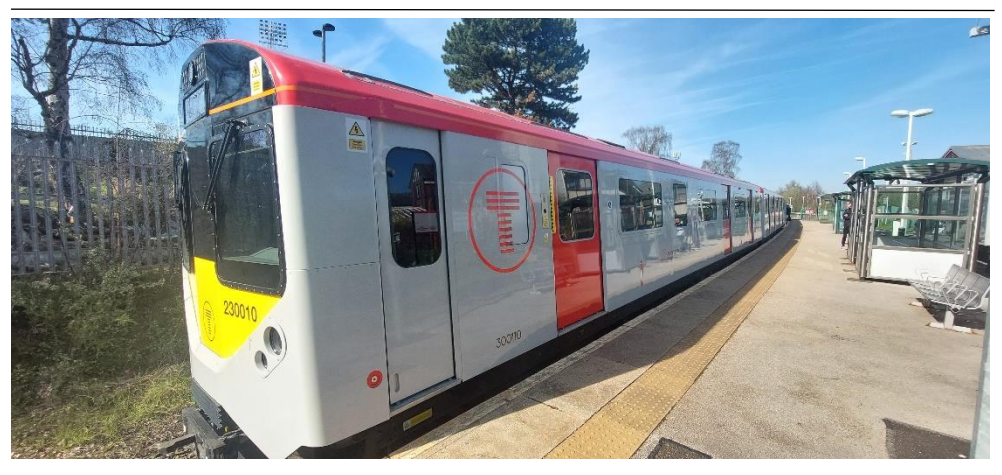
TfW Class 230 at Wrexham General on its first day of operation on the Wrexham – Bidston line.