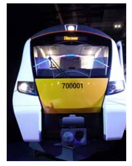
A mock-up of the Thameslink trains to be built by Siemens

The first major competition in the current franchising round was completed on 23 May 2014 with the announcement that the Thameslink, Southern and Great Northern franchise would be operated by Govia Thameslink Railway, a company formed by the Go-Ahead Group and SNCF subsidiary Keolis. The takeover of the combined services, which will be the largest in the country in terms of passenger numbers, will be in two stages with Govia running the Thameslink and Great Northern trains (currently First Capital Connect)